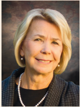
Mary Masick Mayor

City of Hurstbourne 200 Whittington Parkway Suite 100 Louisville, Kentucky 40222 Tel: 502 426 4808