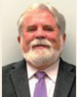
Ben Jackson Commissioner General Government