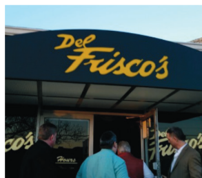
Home to Del Frisco's since 1981