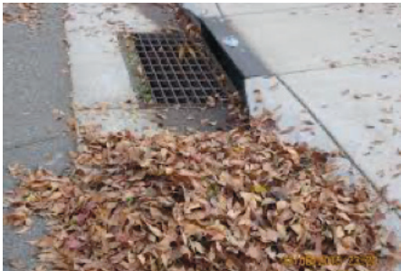
Leaves travel from Curbs and Gutters to Storm Drains

The City picks up leaves in and around the medians. Unfortunately, leaves do not respect property lines and they travel to medians, curbs, and gutters. Whenever possible, please keep the storm water grates in front of your property free of debris. When blowing leaves, please avoid the road, curbs, and gutters.