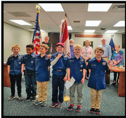
Cub Scout Pack 8 Members pose with Commission

The City Commission and others were treated to a special presentation at the December 14 Commission meeting. Second graders from the Wolf Den representing Cub Scout Pack 8 attended the meeting to perform a flag ceremony and lead the pledge of allegiance to open the meeting.