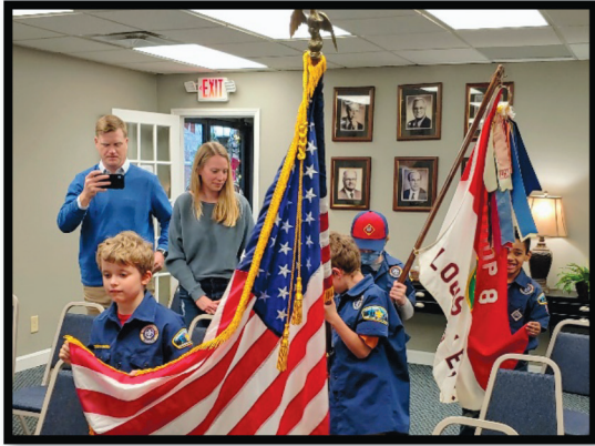
Cub Scouts prepare to present Colors