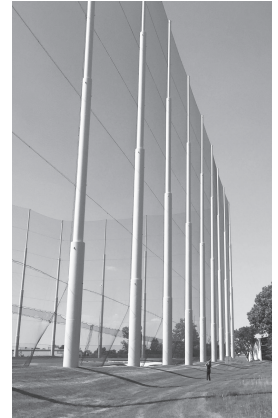
Towering Topgolf poles and netting