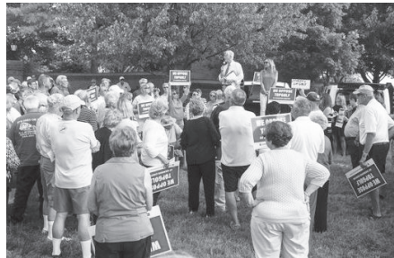
Hundreds show up for rally